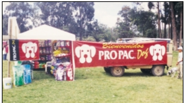
PRO PAC® as the official sponsor at an international dog competition in Quito, Ecuador, August 2001.