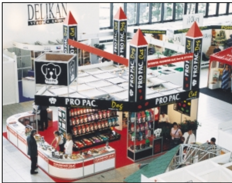
PRO PAC® display stand at the Pro Pet Trade Show in Brno, Czech Republic, June, 2001. Velkoobchod Salac, PRO PAC® Distributor in Czech Republic.